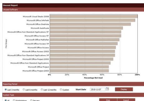
Report on instances of software usage and unused software installed

Equally, in a terminal services environment it is important to identify devices that do not access software. Effective SAM is even more complex in this type of environment as most licences are device based. For example, if an organisation has published Microsoft Project then all devices (both PCs and thin-clients) that can access Microsoft Project would have to be licensed regardless of actual requirements.